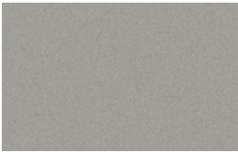
Xtreme™ Champagne 9647302Q R160 G158 B153 – LRV 39% Satin